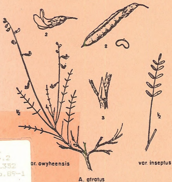
Asragalus atratus var. owyheensis